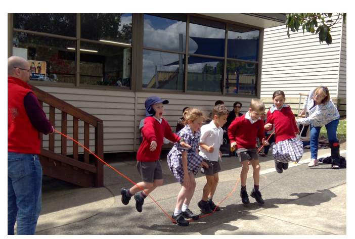
Enjoying a traditional game of skipping

It was a delight to host Grandparents' Chapel! Following the service, we invited our grandparents and special friends to enjoy a lovely afternoon tea picnic in the sunshine. We chatted and shared stories and played old-fashioned games, including quoits, marbles and skipping. It was such a special day! In Maths, we have been studying Australian money, learning about the images, colours, shapes and values of the coins. In English, we are busily writing our final pieces for our Multi Genre Writing Projects. After our hard work, we cannot wait to present our masterpieces to everyone.