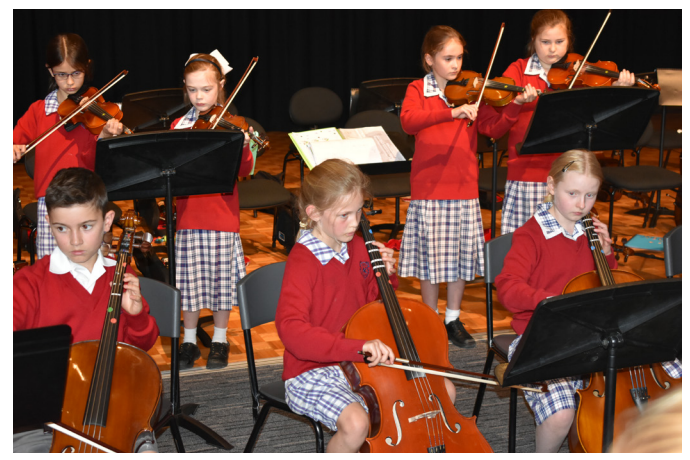
Beautiful performance by Year 2

Our Year 2 Strings students performed for their families, showing their amazing progress throughout the year. The students were so excited to perform, and have loved learning their string instrument. Many of our Year 2 students have applied to continue lessons on their chosen instrument in 2019.