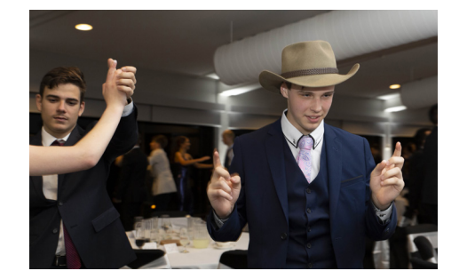
Year 10 Formal