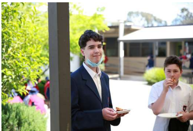
Year 9 students enjoying a Welcome Back pizza lunch together

What an exciting day Monday 26 October was! After months of lockdown, the entire student body was finally back on site. Observing the joy of students catching up with each other after such a long absence was truly moving and exciting. There was little nervousness evident as friendships and routines were quickly re-established. Well done to all students, indeed all families, for your commitment to persevere through this year, supporting each other and trying your hardest. An unusual year is certainly an understatement, but several new skills have been acquired, including a plethora in IT, self-management, planning, and personal attributes have grown, such as confidence, resilience, adaptability and innovation. I hope that you are able to reflect and acknowledge how much personal growth has occurred – you should be well pleased!