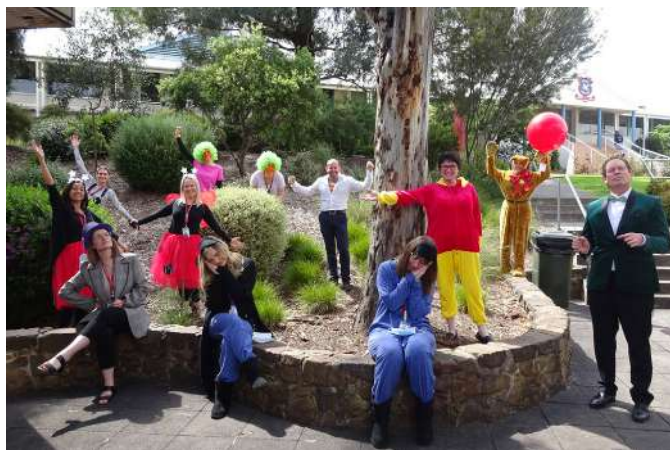
Junior School teachers in character