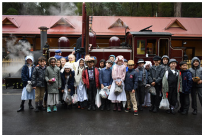
Year 2 enjoying their Puffing Billy adventure

Yarra Ranges Museum dressed in old fashion clothes. We compared past and present forms of travel, taking a trip on both a Metro train and Puffing Billy. We discovered that a modern train is faster than a steam train.