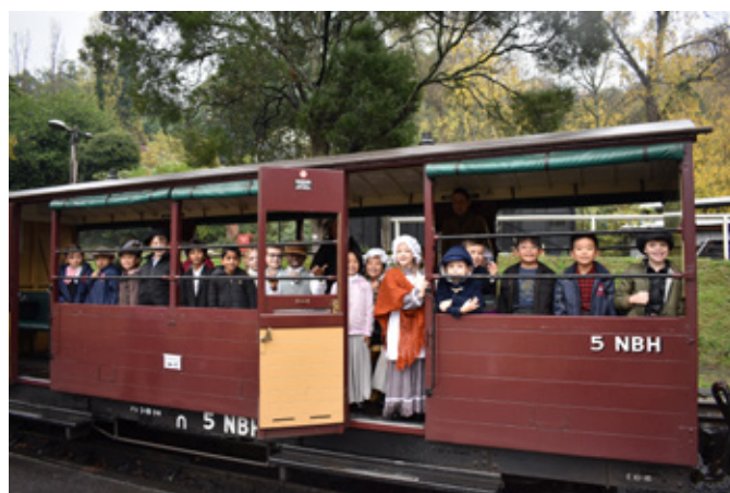
All aboard Puffing Billy

At the Museum, we explored the local history of Lilydale and how it has changed over time. Our favourite part was making toy dolls using pegs. Using our new knowledge about the past, we have started to write historical narratives in Writing. We cannot wait to share our stories with the staff at the Museum to showcase our learning!