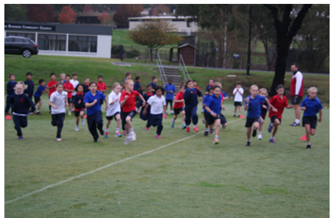
Year 2 girls get off to a quick start