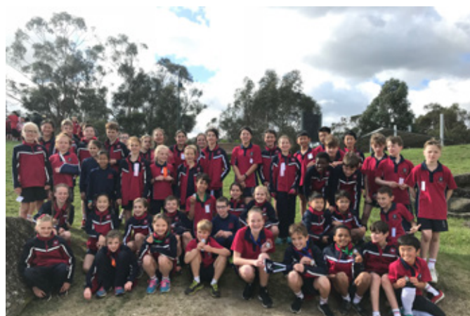
District Cross Country team

On Tuesday 29 May, 51 students from Years 3-6 competed at the Mooroolbark District Cross Country. Having had success in our House Cross Country, selected students were required to run 2km (9-10 year olds) or 3km (11-13 year olds) around Lillydale Lake.