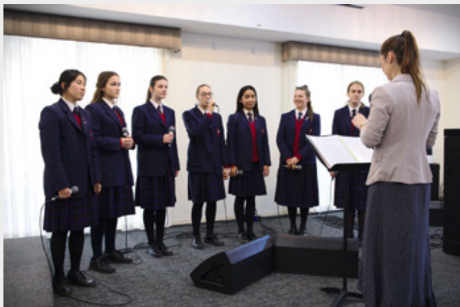
Melodia Vocal Ensemble perform at the National Day of Thanks Shire of Yarra Ranges Mayoral Breakfast