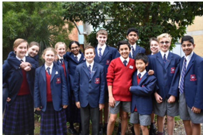
Year 7 Da Vinci Decathlon team

The Da Vinci Decathlon is a competition where groups of Year 7 students compete against other schools in ten different subjects. These include normal subjects you find at school like Mathematics, Science and English and others that you don't such as Codebreaking and General Knowledge. We had two teams, both did extremely well and were up against some very tough competition. It was an amazing opportunity for everyone and we all thoroughly enjoyed this experience.