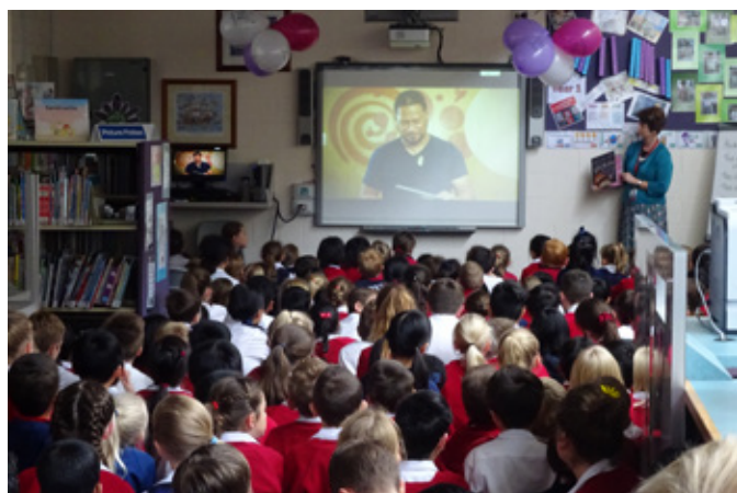
National Simultaneous Storytime reading in the Resource Centre

Around 200 Junior School students packed into the Resource Centre, eagerly anticipating this year's National Simultaneous Storytime reading of Hickory Dickory Dash.