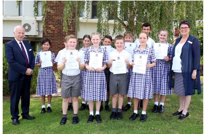
Junior School Leaders