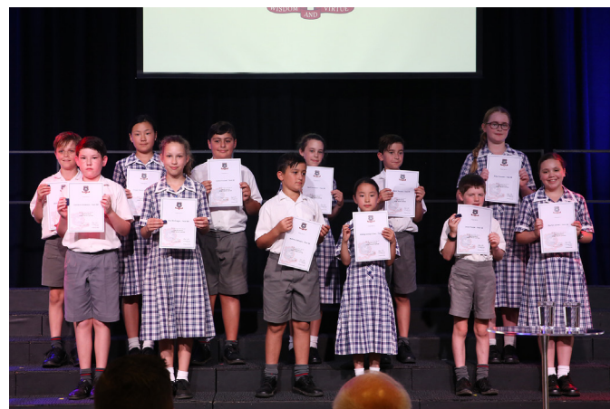
Year 4-6 Home Group Captains