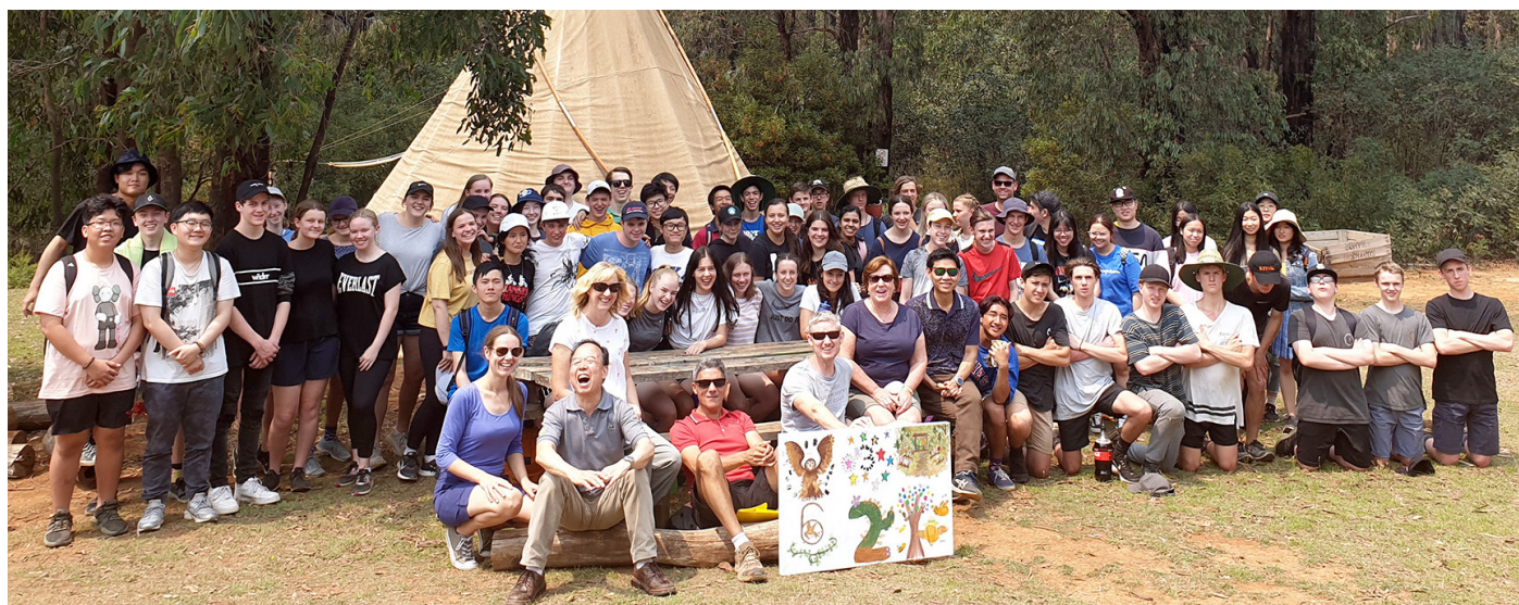
Year 11 students and teachers enjoyed their time together