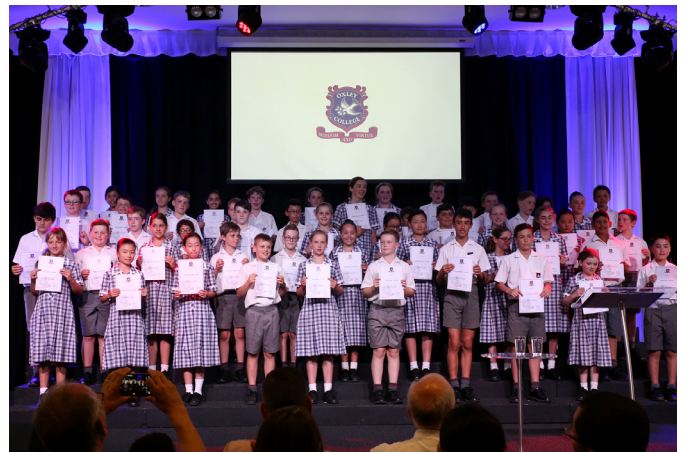
Year 6 Student Leaders

On Tuesday 11 February, Year 4 - 6 students participated in the House Swimming Sports at the Kilsyth Centenary Pool. Our students appreciated support from parents as they competed in a range of events. We were so blessed with warm weather too! Congratulations to the winning house, Zion Crusaders!