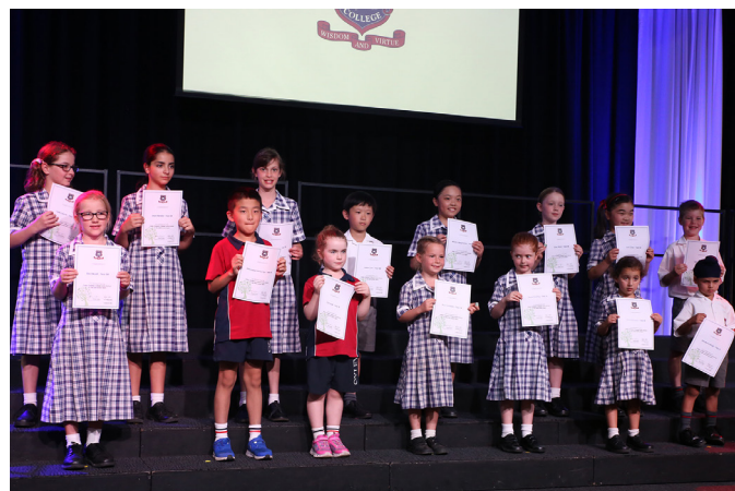
Prep-Year 6 Enviro Captains