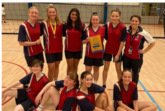
Year 8/9 Girls Volleyball B team was Runners Up in the Grand Final