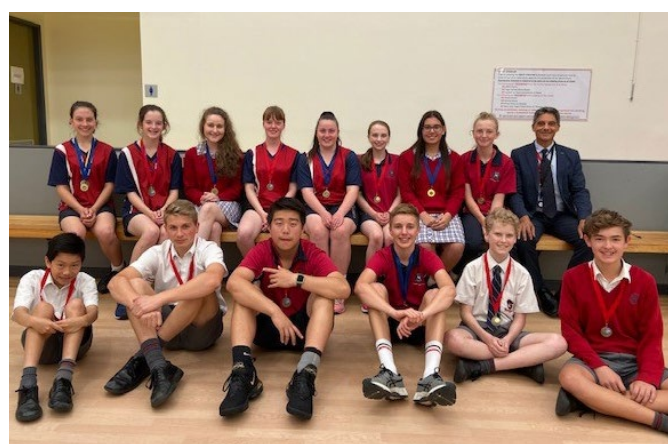
Year 8/9 Most Valuable and Best Team Player recipients for Term 4 EISM Sport