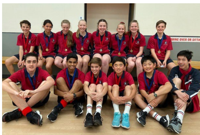
Year 7 Most Valuable and Best Team Player recipients for Term 4 EISM Sport

The Year 7s had a great year in Sport and won almost every sport and carnival they participated in. Congratulations