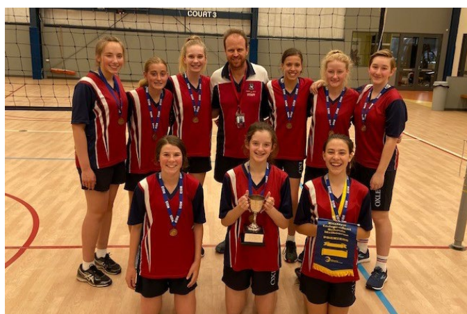
Year 8/9 Girls Volleyball A team won the Premiership

Our Year 8/9 Soccer and Volleyball A Girls teams put in a great effort in the Grand Finals this term. Both teams managed to push through to be crowned Premiers for 2019. The Soccer team won by a goal in extra time and the Volleyball A team claimed victory in 5 sets. The Volleyball B team just missed out on victory in their fifth set. Congratulations to all three teams on a great achievement.