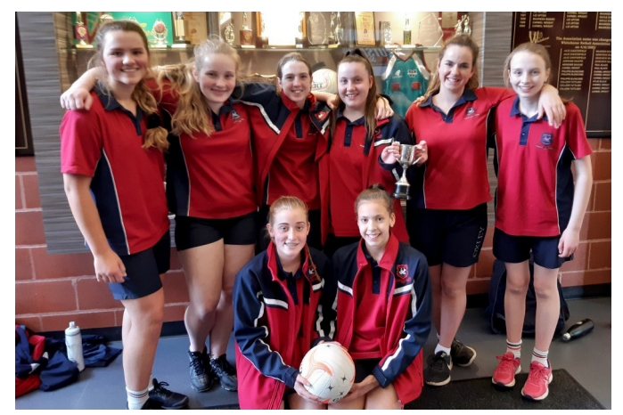
Year 8/9 Girls Netball B