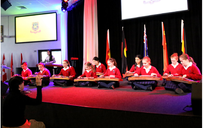
Chinese Horizons class performing on the Guzheng