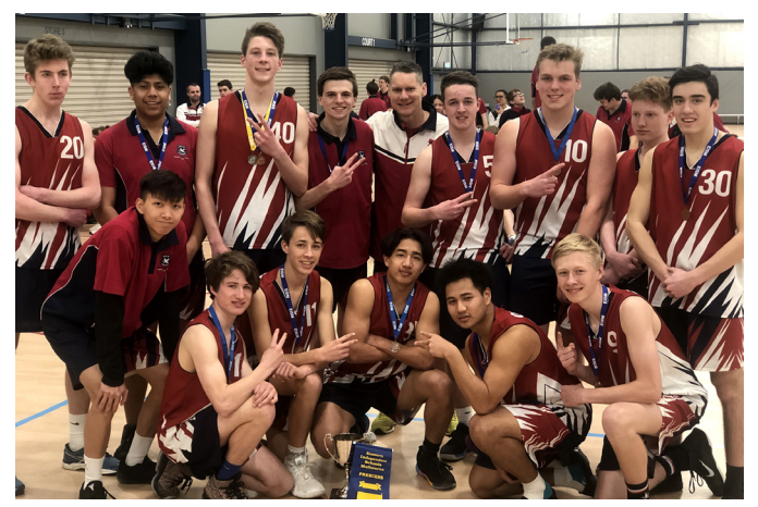
Senior Boys Basketball

Below is the list of students who were rewarded Most Valuable and Best Team Players for their teams. Congratulations to all these students for putting in a such great effort.