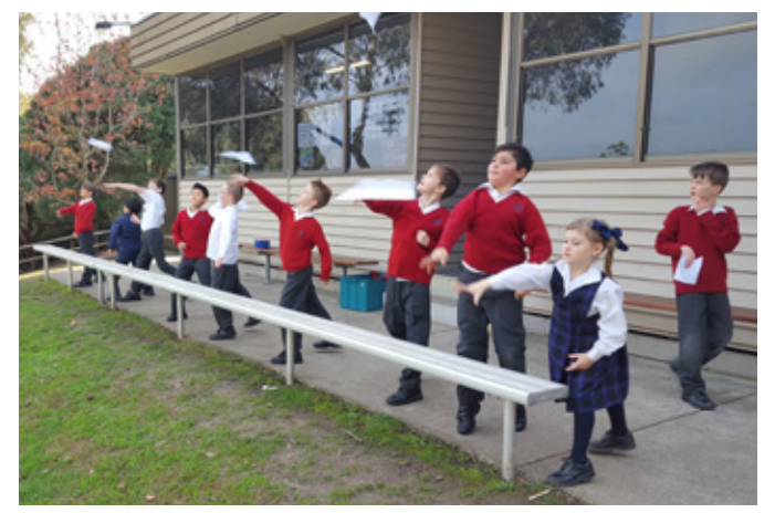
Testing paper planes