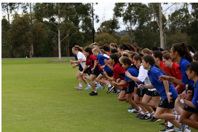
Year 7 girls are off!