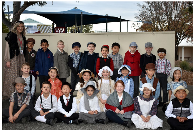
2W dressed in old fashion clothing