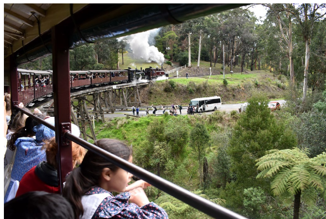
Year 2 students looking out the window on Puffing Billy