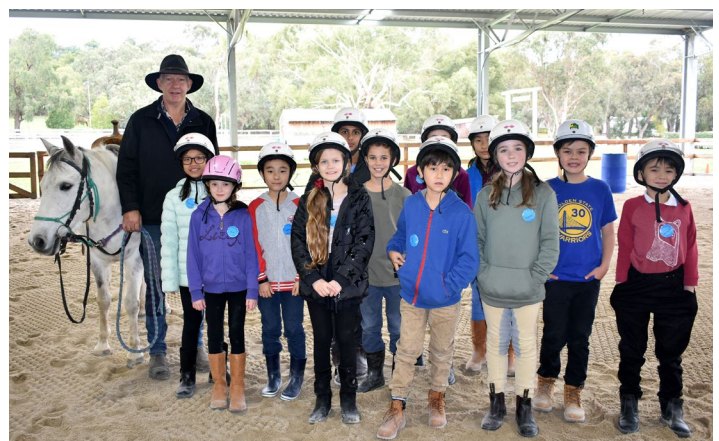
Horse riding lessons were a highlight