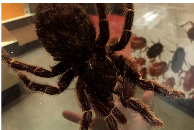
A hairy tarantula!