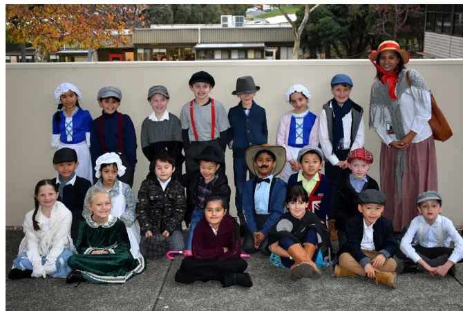
2M dressed in old fashion clothing