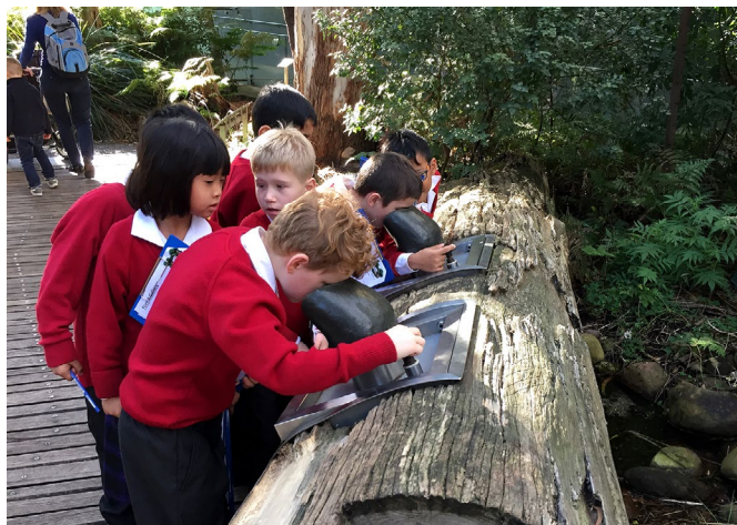
Xavier, Grace and Rory looking at spiders that live in logs

We had a marvellous day at Melbourne Museum! In Science we are studying Living Things so we visited the Forest Gallery to learn more about plants, the Bugs Alive! exhibition to have close encounters with minibeasts and the Wild exhibition to study the features of wild animals. It was wonderful to see the creatures we have been studying close up. The large hairy tarantulas were rather creepy! The IMAX movie, Flight of the Butterflies 3D , was brilliant! We all tried to catch the butterflies that appeared to be flying all around us!