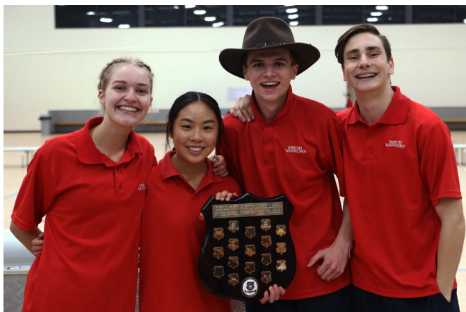
Red House celebrating their victory