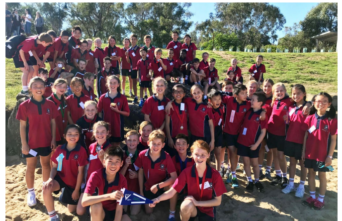
The Oxley District Cross Country team celebrating together

Congratulations to all students who competed. We are looking forward to much success at the Yarra Division Cross Country.