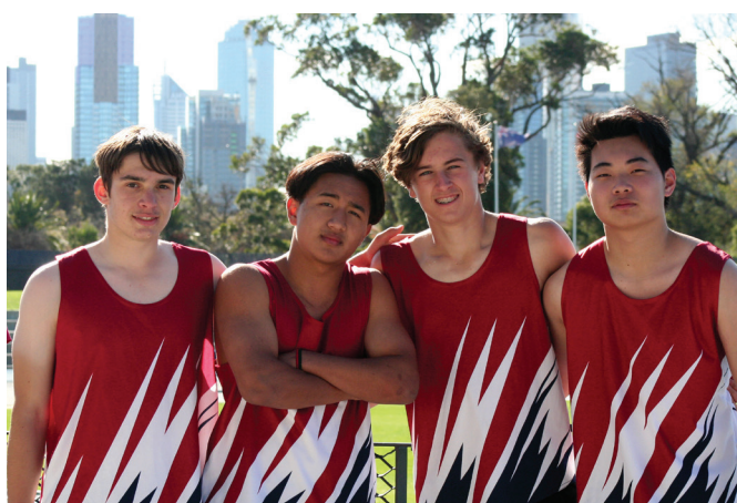
U16 Boys Relay team