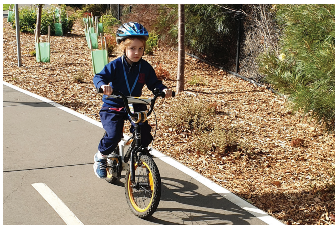
Hope (Prep M)