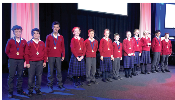
Interschool Sports Medals

In Term 1, students in Year 5-6 competed in the Mooroolbark District Interschool Sports. With 7 rounds of competition, students learned how to work as a team to achieve success in their allocated sport.