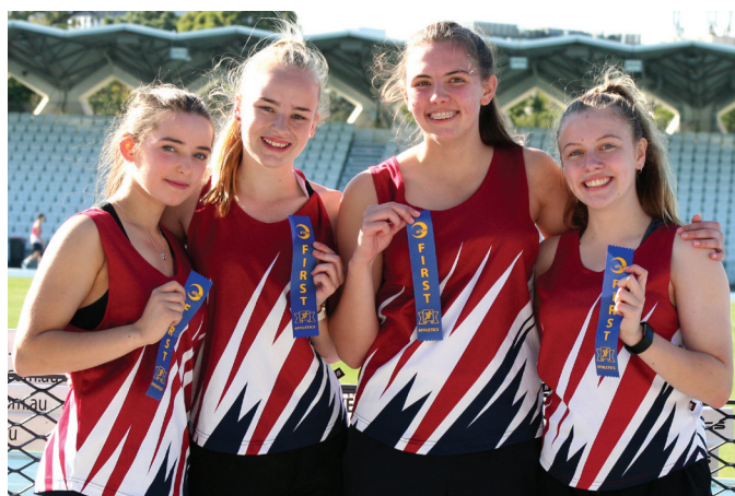
U16 Girls Relay team