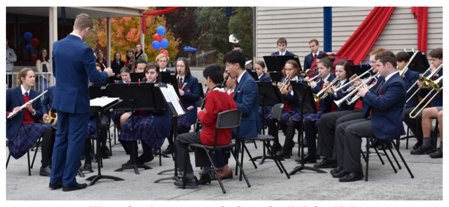
"I am the vine; you are the branches". John 15:5a