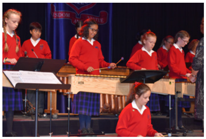
Year 5 and 6 Vivace Percussion Ensemble