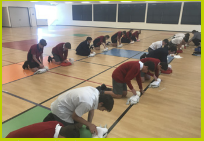
Completing CPR and first aid training