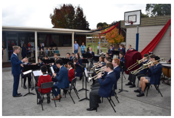
Senior Concert Band

Now, with the conclusion of Open Day, our concert season begins. Please see the details below for dates and times of upcoming concerts this term, and the performers involved. Please note that, due to a Year 5 excursion, our Cherub Choir will now perform at School at Work on Thursday 24 May instead of our Seraphim Choir. Further details will be sent home about each performance listed below.