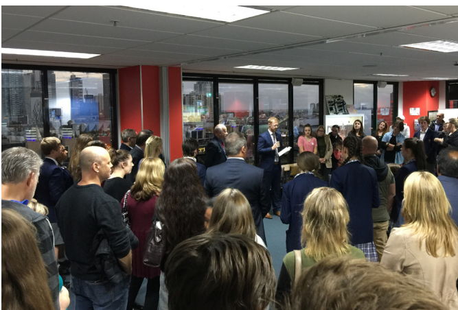
City Cite Parent Presentation

City Cite also unfolded over the last 3 weeks of term, culminating in the Parent Presentation Evening. The night started very late with a train delayed significantly due to a tree down, parking was a nightmare for some, and a football match attracting a large crowd was being played several hundred metres away. But nothing could dampen the enthusiasm of the evening as the students showcased what they had learned investigating a significant social issue, relating to Homelessness, Drugs and Alcohol, Graffiti or Street Art and others.