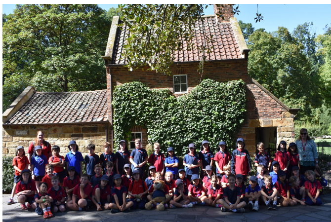
Year 3 visit Cook's Cottage

We had a fabulous time on our excursion to the city, where we visited the Shrine and Cook's Cottage. At the Shrine our guides taught us why we have a Shrine, to remember those who died in the war. We heard stories of the men and women who fought for Australia and learnt about the significance of poppies. Did you know that purple poppies are used to remember animals who helped in the War? Inside The Shrine we participated in a short service and saw where the light shines through the roof at 11.00am each day. We also saw the eternal flame.