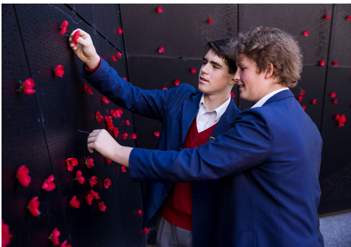
Year 9 Students at the Melbourne War Memorial during their time at City Cite.