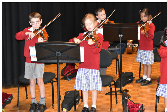
Year 2 Strings

week the students were able to take their instrument home for the first time and were very excited to do so.