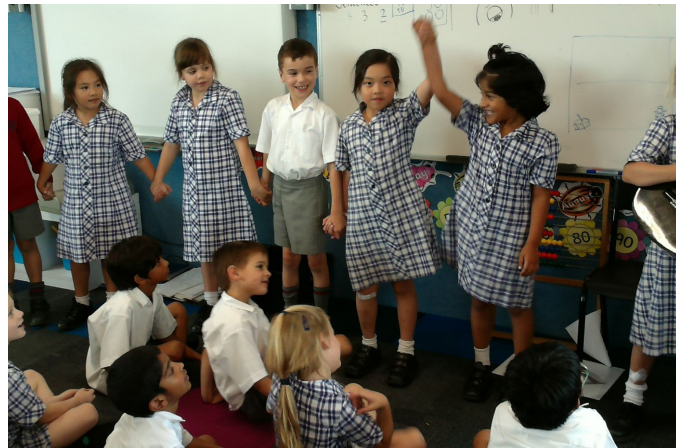
Year 1 students show what a sound wave looks like