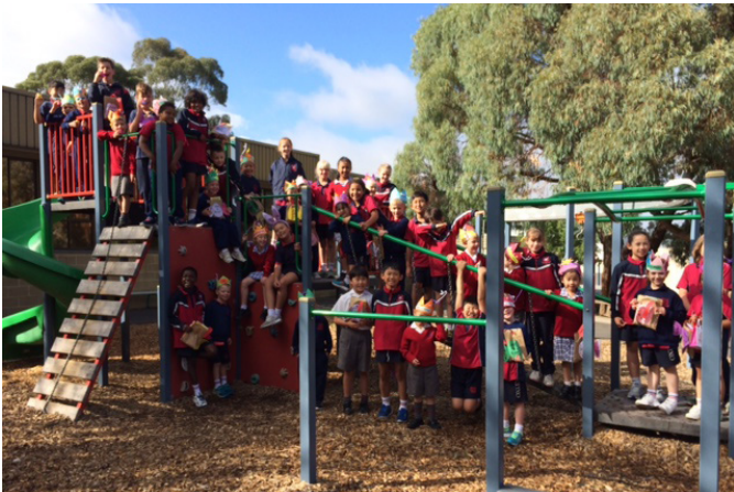
Prep W and 4KB having their Buddy Easter Egg Hunt

Our buddies hid eggs and we had so much fun trying to find them. We then counted them out and shared them. We have loved meeting our buddies and can't wait for more exciting times with them this term.