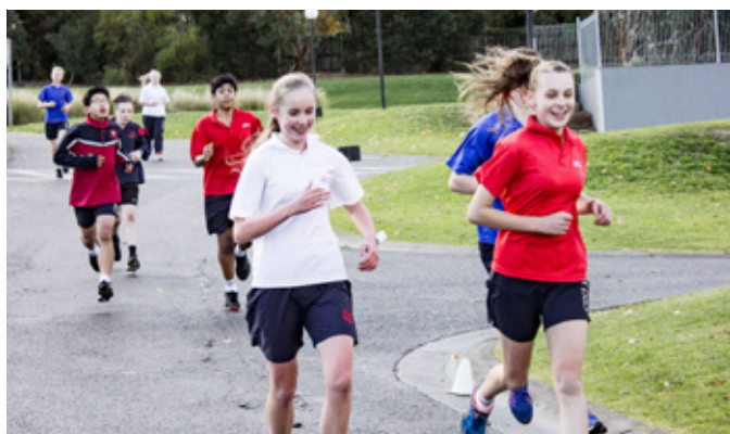
2017 House Cross Country

Our House Cross Country will take place on Tuesday 29 May on a track marked out around the College. Students are reminded that they all will be participating unless they have a medical certificate or a note from their parents requesting that they not participate. Students may still prepare for this event by attending the fitness group on Thursday afternoons starting at 3.45pm on Court 3 in the Stadium.