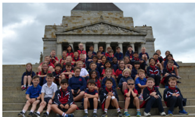
Year 3 on the steps of The Shrine of Remembrance

We had a fabulous time learning about the history of our city on a guided walking tour of Melbourne. We explored secret alleyways and discovered buildings that still look exactly as they did over a hundred years ago. Did you know that one of the underground tunnels in Flinders Street Station used to lead to a department store? After lunch, we visited The Shrine to remember those who died at war. We saw the Eternal Flame, learnt about the significance of poppies and participated in a short remembrance ceremony.