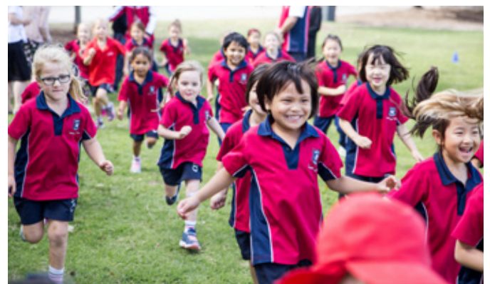
Junior students enjoying the Lap-a-Thon for Amari