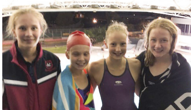
The U/13 Girls Relay Team

Other swimmers performed well against strong competition from some of the bigger schools in Melbourne and should be congratulated on their efforts. Our U/13 Girls Relay team came 7 th in the Medley relay and in the Freestyle relay.