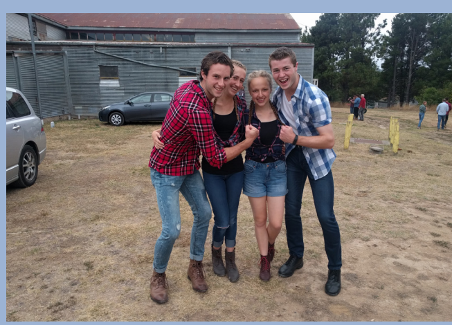
Forming special bonds at the bush dance!