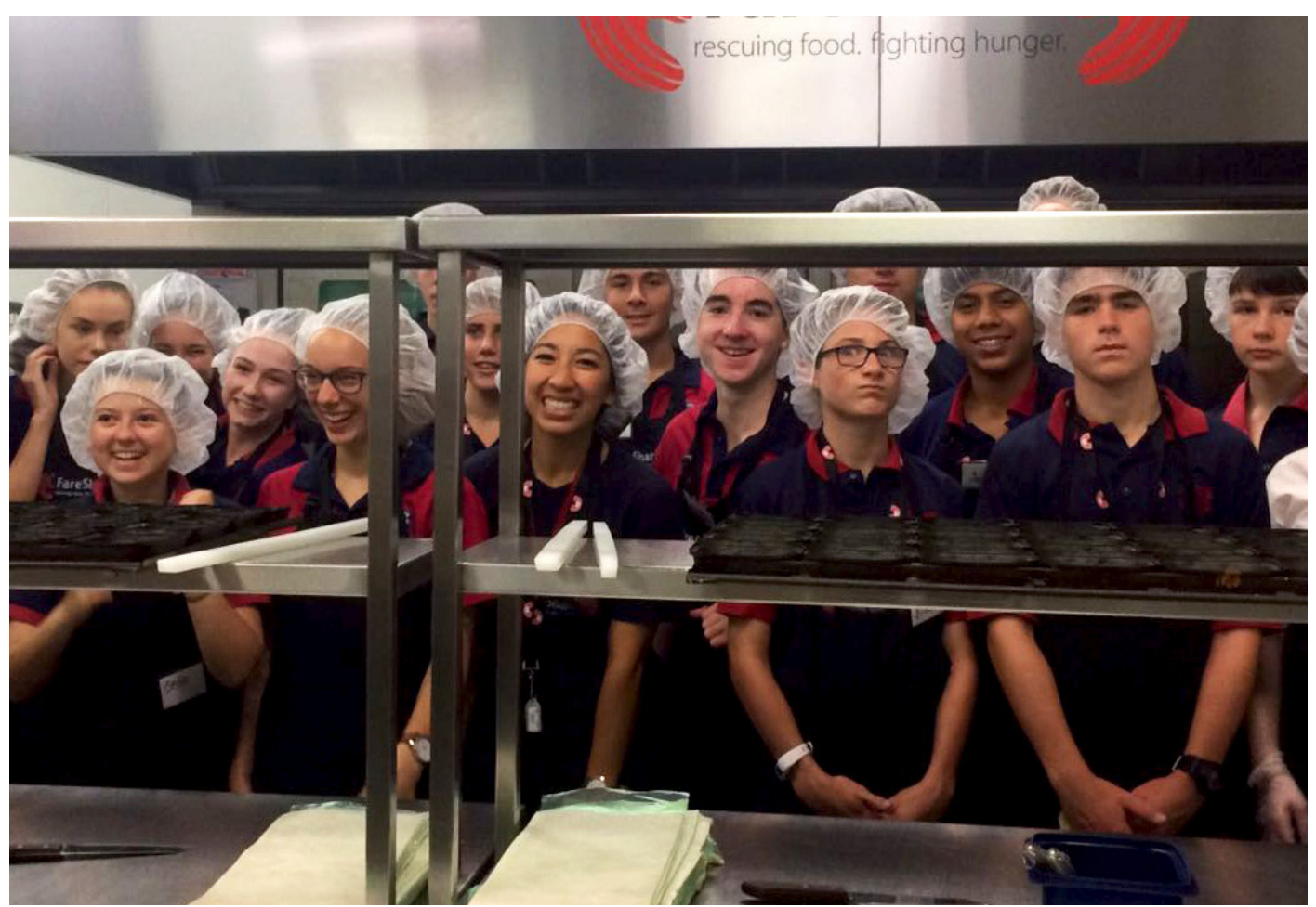
9.19 at Fare Share kitchen