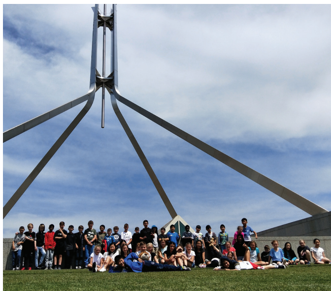
Year 6 at Parliament House