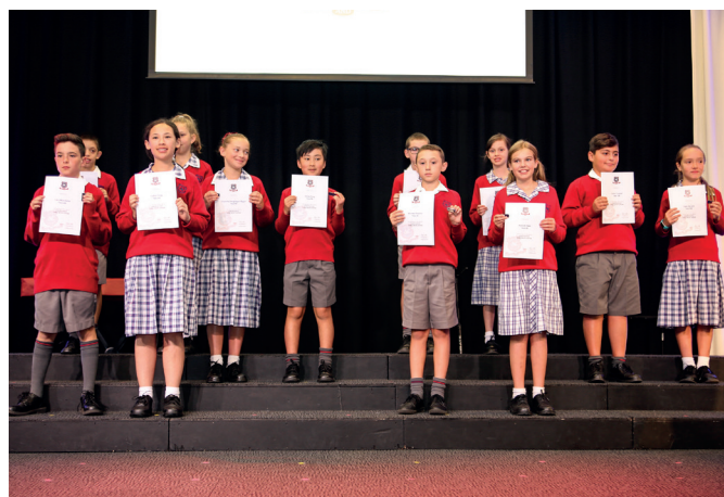
Semester 1 Home Group Captains

We apologise for the incorrect photo inserted for our Semester 1 Home Group Captains in the last edition of The Vine .