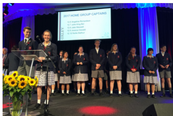
2017 Senior School Home Group Captains