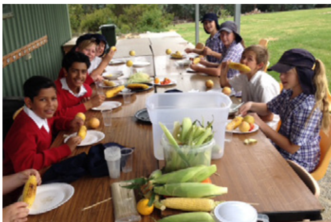
Students enjoying the home grown corn on the cob

The students were asked, Where's the sustainability in that? Their answers were perfect! The corn in our garden is organic - no chemical sprays or fertilizers. That's good for us, good for the native animals and good for our environment. The cost was low - that's also good for us. We are helping to support our local farmers when we buy their corn. The fibre surrounding the corn is used as compost, making new soil for our gardens. The most sustainable part is that God put so much care into creating corn. It is protected and cushioned by its fibre. Even more importantly, He made something that is delicious for us to eat. We delight in God's creation and thank Him for tasty and nutritious food that we can enjoy.