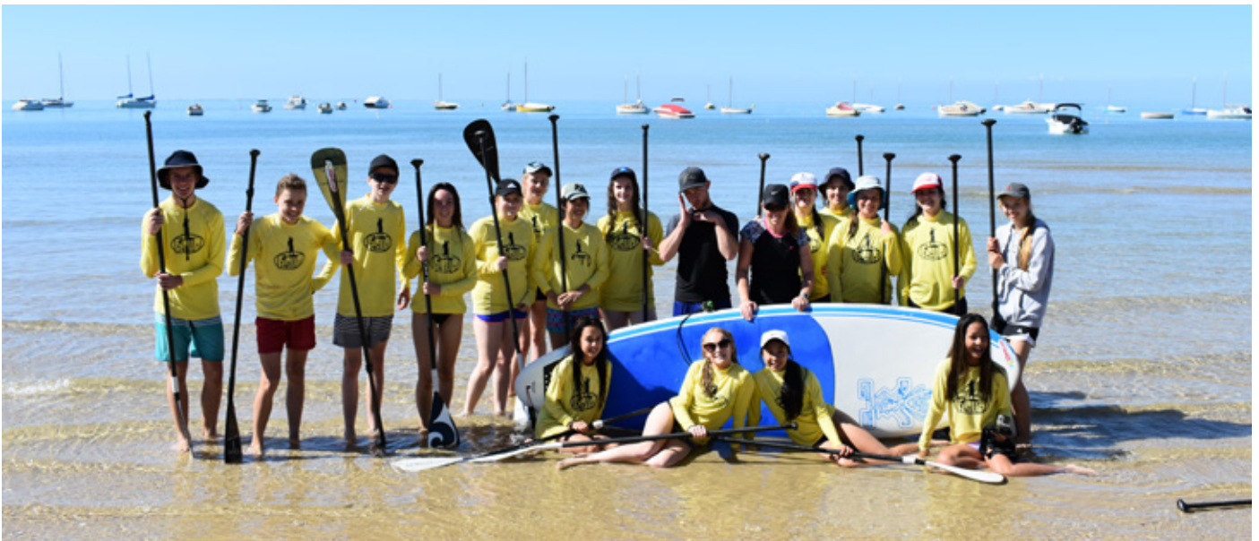
Year 10 Aqua Camp

==== "I am the vine; you are the branches". John 15:5a =====