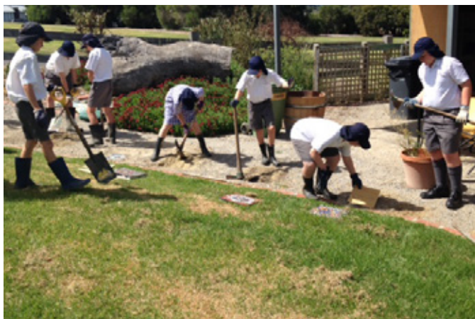
Year 6 students creating a path with mosaic paving stones

The Year 6 students created a fabulous pathway with paving stones that our Year 4 students decorated in Art with Mrs Elliot last year.