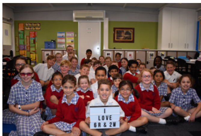
Photo of Year 6 with their Year 2 buddies

At Chapel a fortnight ago, our Junior School Captains, Vice Captains and House Captains were invested. Today the Year 6s received their Leadership badges. They have already been working in their Leadership Teams – Sports, Community Action, Chapel, Drama, Graduation Presentation, and Hospitality.