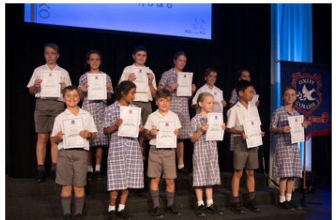
Junior School Home Group Captains

On Thursday 2 March, at our weekly Chapel service, all Year 6 students received a leadership badge to acknowledge their important role as the senior members of the Junior School. We also acknowledged our Home Group Captains and Enviro Team Captains. We look forward to seeing how these young leaders responsibly and faithfully influence our school community for God's glory.