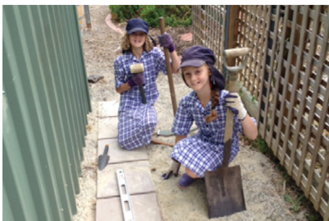
Year 4 students creating a level pathway

The Year 4 students investigated various types of surfaces used in the environment to create a path, such as Lilydale Toppings, sand and rocks. The Year 3 students were busy weeding the Butterfly Garden in preparation for its beautiful new flowers.