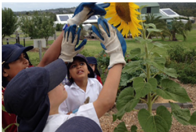
Year 2 students fascinated by the beautiful sunflowers

The Year 4 students investigated various types of surfaces used in the environment to create a path, such as Lilydale Toppings, sand and rocks. The Year 3 students were busy weeding the Butterfly Garden in preparation for its beautiful new flowers.