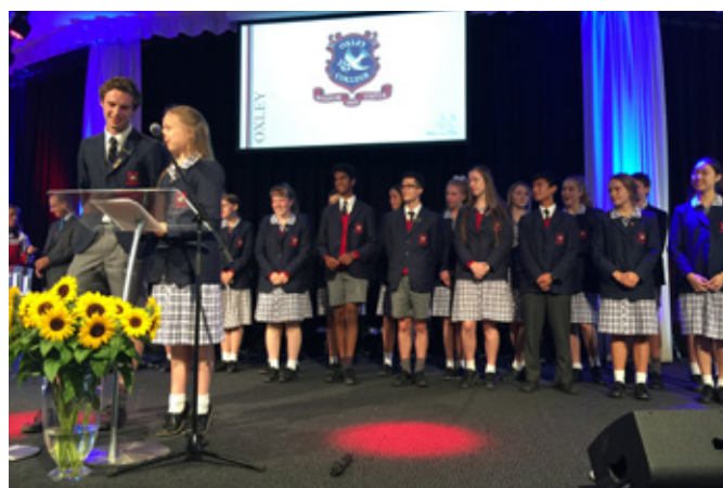
2017 Senior School Subject Captains