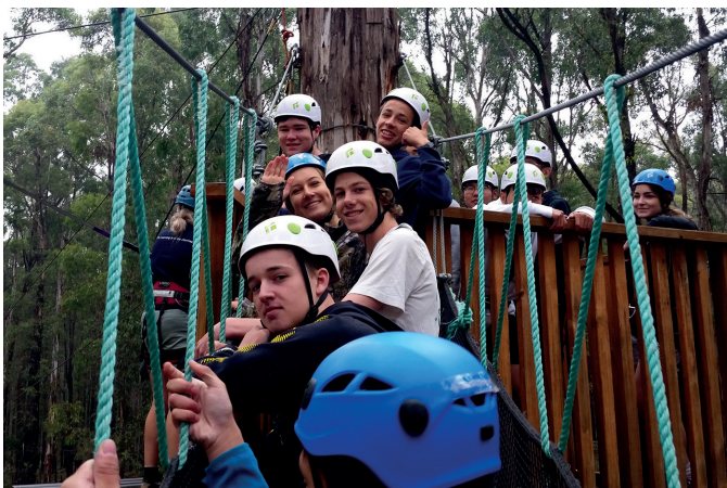
Some of our Year 11s enjoying new heights

Year 11 students visited Kinglake and the highly energetic students enjoyed the scenery, the accommodation and the activities which took place over three days and two nights. There was a focus on teamwork and community as these students undertake the two year VCE program which will continue their lifelong educational journey.