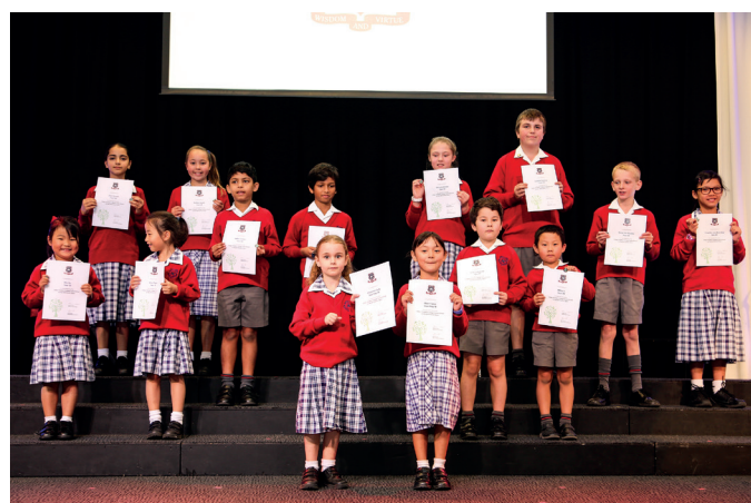
Semester 1 Enviro Captains