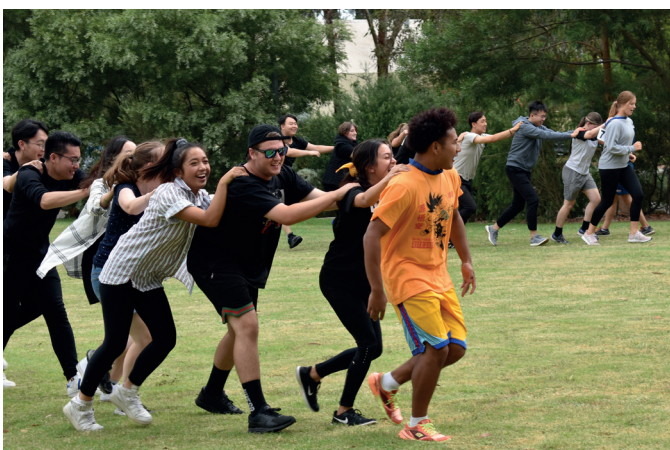
Our Year 12s had fun working as teams