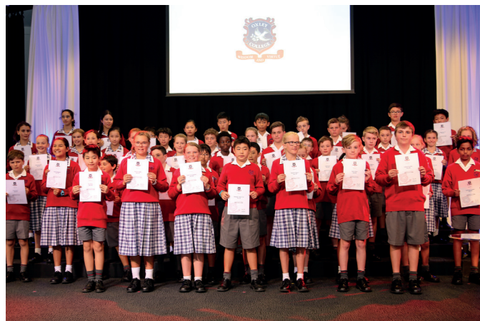
Semester 1 Home Group Captains

On Monday 18 February, Year 4-6 students participated in the House Swimming Sports at the Kilsyth Centenary Pool. Our students were bolstered by the support and encouragement offered by parents and peers as they competed in a range of events. We were so blessed with lovely weather too! Congratulations to the winning house, Zion Crusaders. Go to pages 6 and 7 for photos.