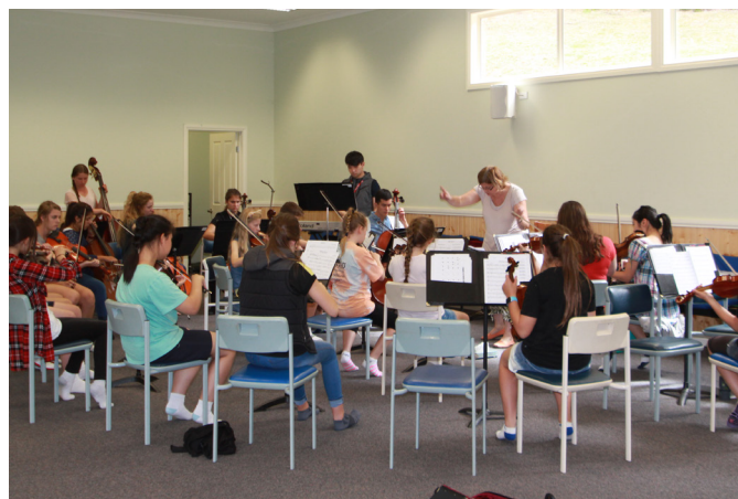
2016 Music Camp

Our Music Camp date and destination have changed this year. We had a great few years at Ferngully Lodge in Healesville but, with so many students now involved in our ensembles, we have outgrown their facilities. We will be holding our Music Camp on Thursday 27 to Saturday 29 July and it will be held at Oasis in Mount Evelyn.