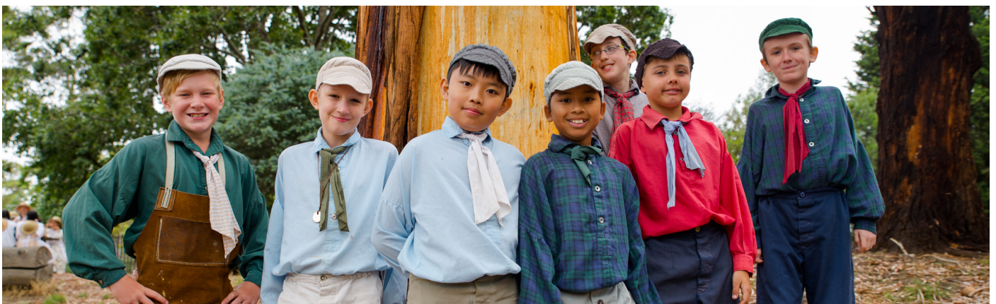
Year 5 Sovereign Hill Camp

"I am the vine; you are the branches". John 15:5a