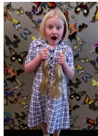
Samara's before and after shots!