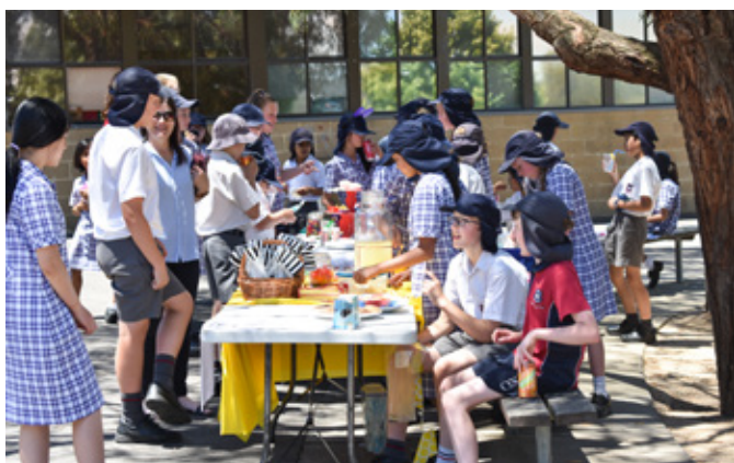
Junior School Market Day 2017

Over a number of weeks, students in Years 3-6 spent time planning, collecting, creating, cooking, designing and organising their products, games and stalls in preparation for selling them to the wider school community. The students' enthusiasm has been contagious!