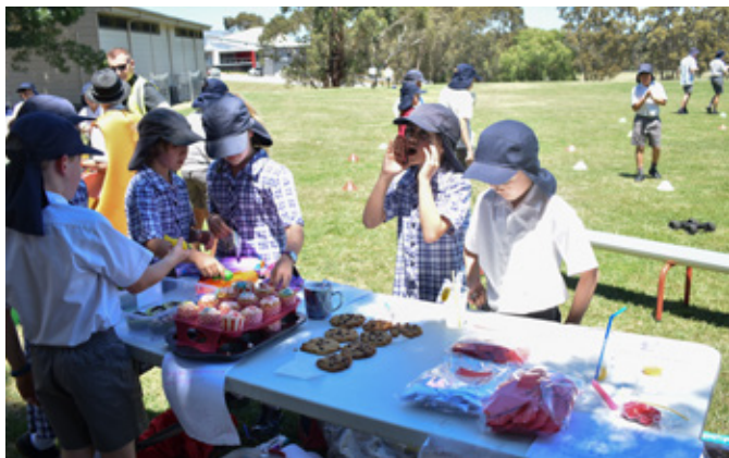
Junior School students setting up their stalls for Market Day

Thank you to all parents, families, friends and staff at Oxley Christian College for your support of our Market Day on Wednesday 22 November. This event was anticipated by many and, without doubt, has become a highlight in our school calendar.