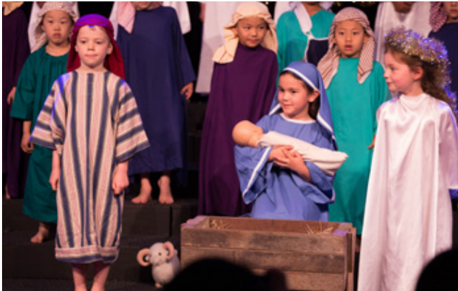
Mary holding Jesus during Prep Nativity