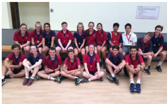
Year 9 EISM Term 4 Medal Winners

Congratulations to all students for your contribution to sport in 2017, especially those who served as captains in the various teams. A big thank you to all our Year 12 students who willingly gave up their time to represent Oxley in their final year. Thanks to all our students for making us proud through your behaviour in competition throughout the year. Let's make next year an even bigger year in Oxley Sport. Keep fit during the holidays and see you all in 2018. I wish you all a blessed Christmas and a prosperous New Year.