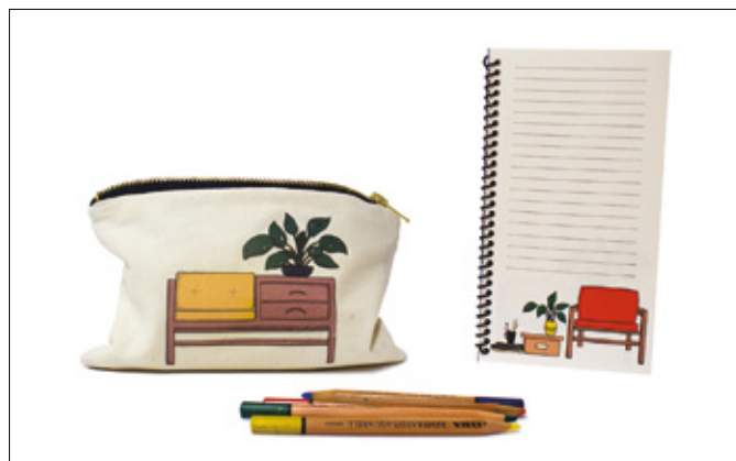
Designed by Brittany