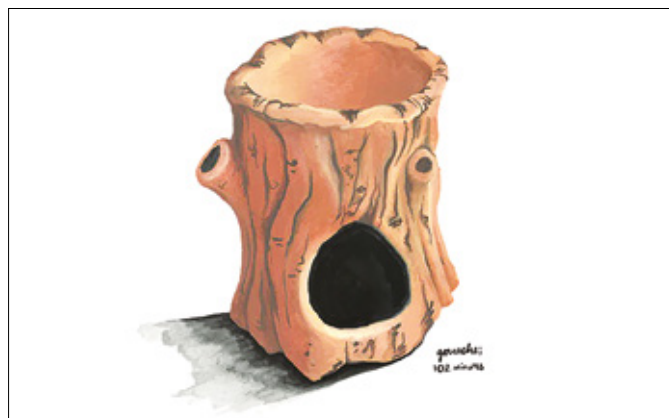
Designed by Caitlin