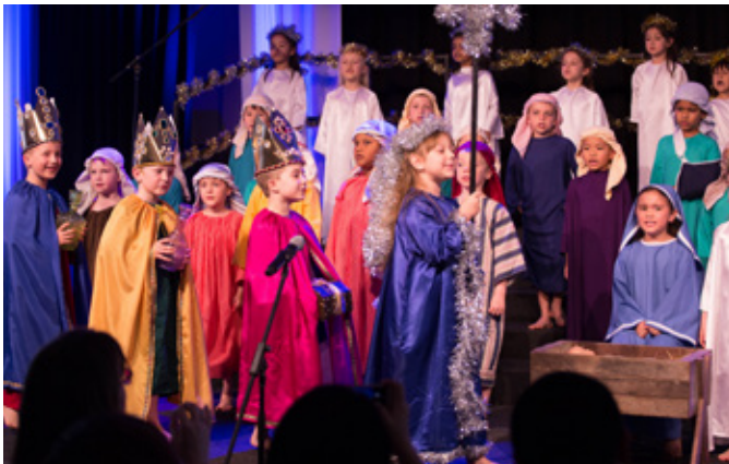
The Wisemen following the star to meet Jesus