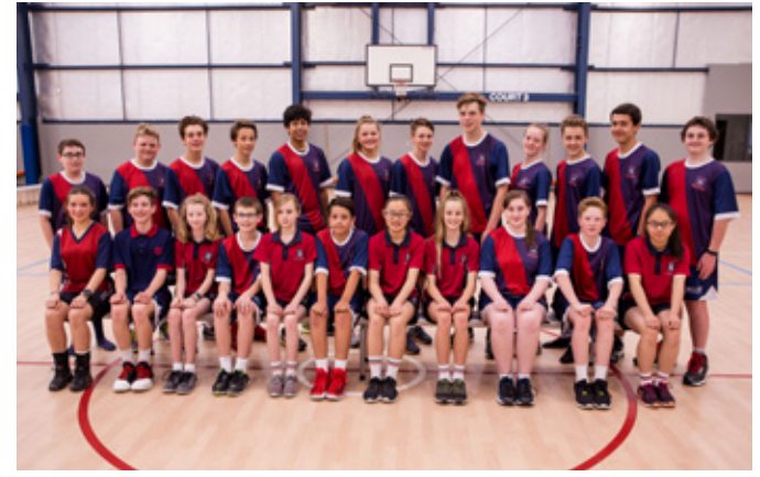
2017 Oxley Institute of Sport

Early mornings came to an end for our students in the Oxley Institute of Sport after they had their last training session for 2017 on Thursday 16 November. Students in the Institute of Sport regularly attended training since the Institute opened its doors early in 2016 to improve their skills in tennis, basketball, netball and soccer.