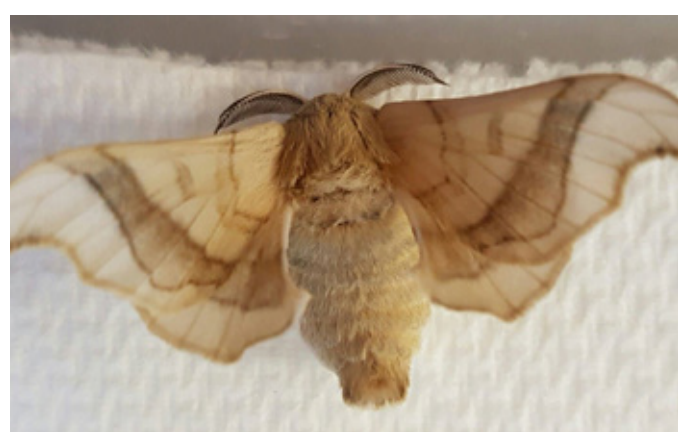
Year 2 silkmoth emerging from its cocoon

Work has continued on our Passion Projects. We have been reading, researching and writing in a variety of different genres. It has been exciting to begin publishing our completed texts. We are working hard to get everything ready for our special book launch on Friday 1 December. Science has been very exciting this fortnight. Firstly, our mealworms started turning into pupa. We are now rethinking our predictions about what they will become. Some of us have changed our predictions and others still think the same. Secondly, the first of our silkmoths have emerged from their cocoons. It was interesting to see the changes that occurred while they were inside the cocoons. Our God is so awesome!