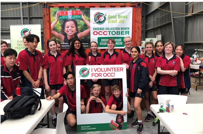
9.19 at Operation Christmas Child Distribution Centre

Thank you to the staff that accompanied each class and made it such an enjoyable day for everyone