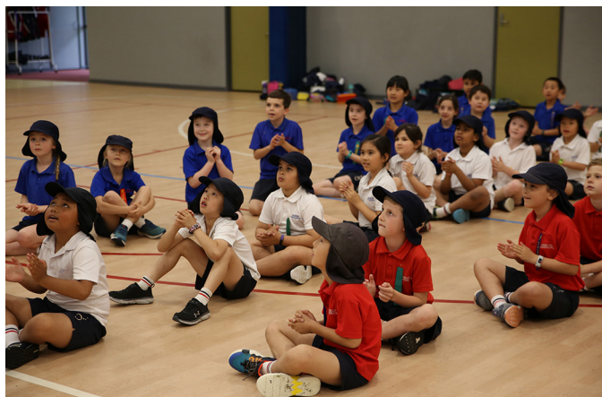
Year 2 students cheering on their team