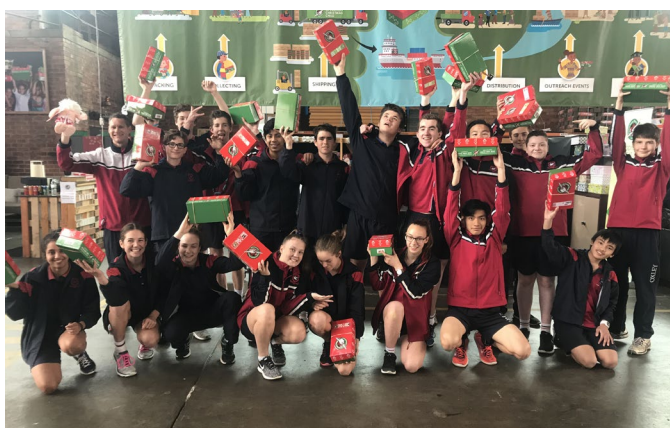
Year 9.19 at Samaritans Purse Distribution Centre