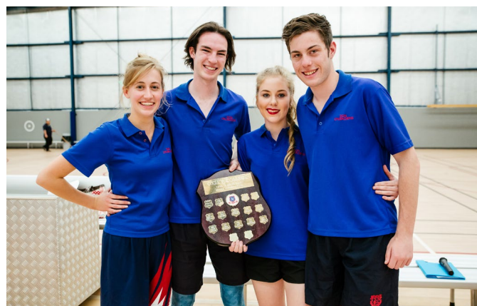
Blue House Captains

Congratulations to all students who competed for their House. Thank you to staff and students who assisted