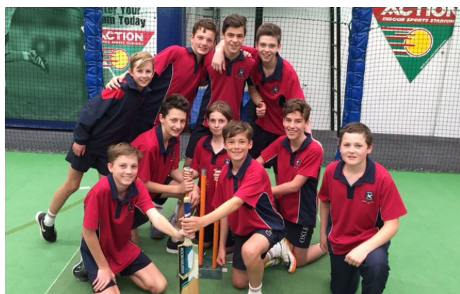
Year 7 Cricket Champions

This year the format for the EISM Year 7 Cricket Carnival changed from outdoor to indoor cricket. On Wednesday 1 November, Oxley competed against Eltham, Nunawading, Alphington, Knox and Rudolf Steiner at the Ringwood Indoor Cricket Centre.