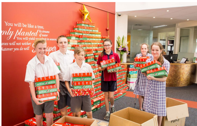
Junior School students helping pack shoeboxes

Philippians 2:3-4 says, "Do nothing out of selfish ambition or vain conceit. Rather, in humility value others above yourselves, not looking to your own interests but each of you to the interests of the others." We are blessed to be a blessing. I sincerely thank you all, for the blessing you are!