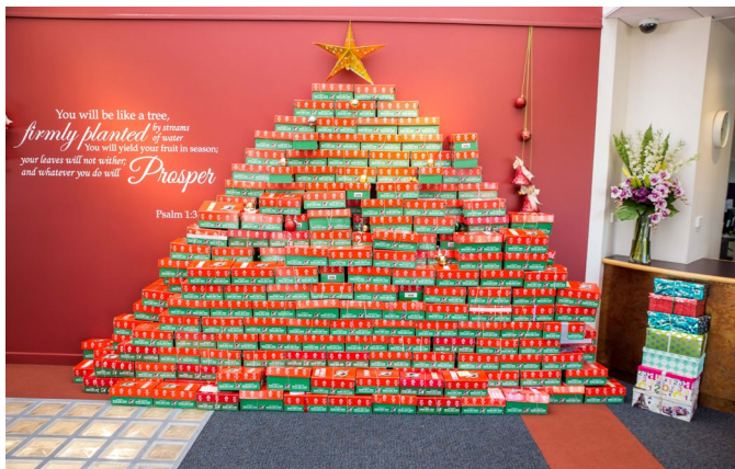
Shoebox Christmas Tree display

Philippians 2:3-4 says, "Do nothing out of selfish ambition or vain conceit. Rather, in humility value others above yourselves, not looking to your own interests but each of you to the interests of the others." We are blessed to be a blessing. I sincerely thank you all, for the blessing you are!