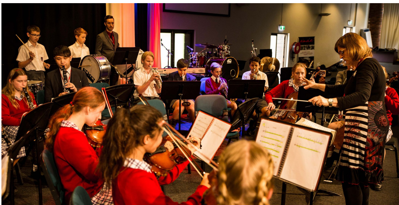
Year 7 Instrumental concert

"I am the vine; you are the branches". John 15:5a