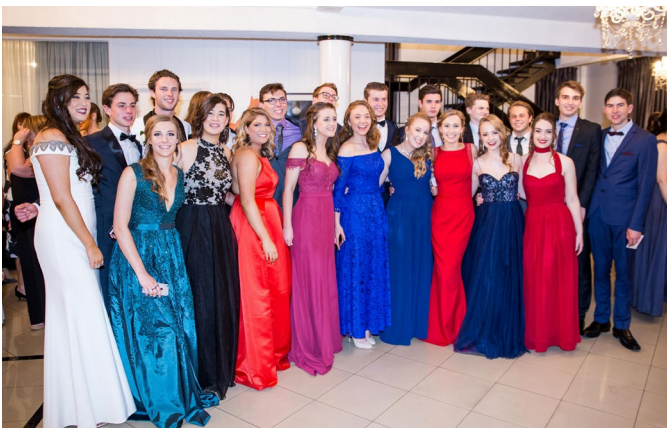
Year 12 Valedictory Dinner

As Junior School students returned to classrooms to enjoy their treats, Senior School took part in a round robin of sporting events encompassing soccer, table tennis and basketball. The aroma of sausages and onions drifted across the outdoor pitch as the annual carnival unfolded and there was great joy and sportsmanship.