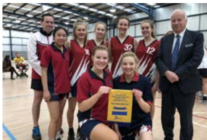
Senior Girls Basketball Team win Runners-up!