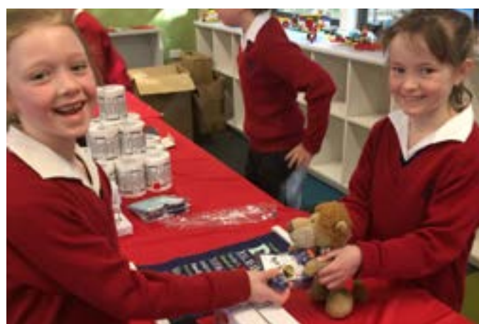
Happy shoppers at the Father's Day stall