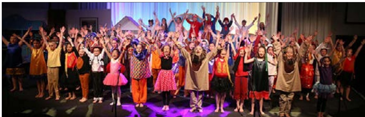
Full cast of the mender

"I am the vine; you are the branches". John 15:5a