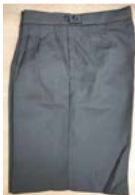
Short #1 – Temporary

Note: All Senior School boys wearing shorts must wear the Oxley standard shorts, the temporary shorts are no longer permitted to be worn.