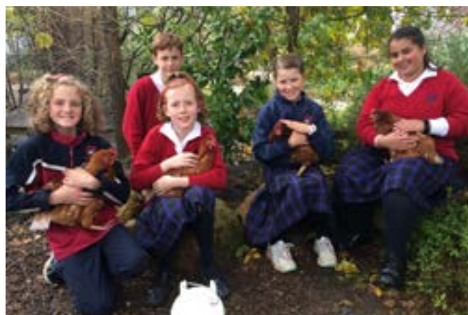
The Enviro team with our new hens