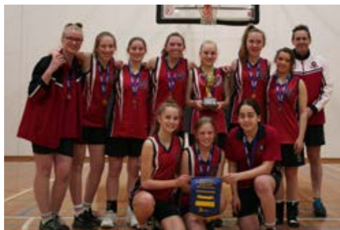
Year 8/9 Girls Basketball Team are Premiers!