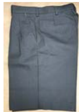
Short #2 – Standard