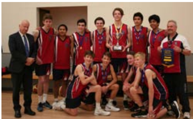
Senior Boys Basketball Team crowned Premiers for the Winter season