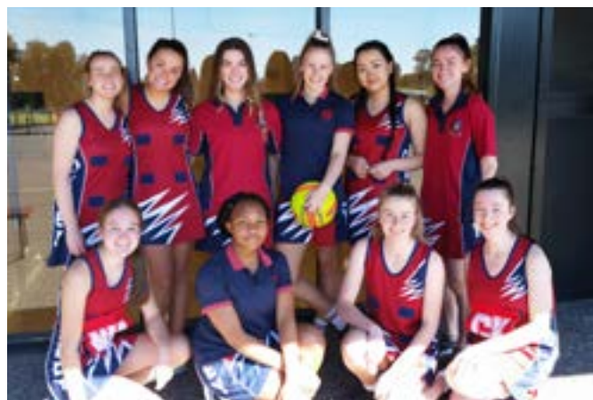
Senior Girls Netball B Team won the Premiership!