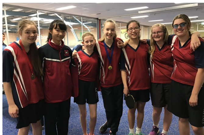
Years 8/9 EISM Table Tennis Team