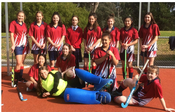
Senior Girls EISM Hockey team