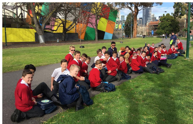
Year 6 enjoying their excursion to IMAX and ACMI

We have been exploring volcanoes, earthquakes and how other natural disasters occur. We visited the IMAX theatre to see Forces of Nature , which provided examples of natural disasters and an insight into the lives of people who monitor them as a job. We also visited ACMI and learnt about the history of film, collecting some interesting ideas for when we make our own videos next term. We've been hard at work learning lines and choreography for the Junior School Musical, which we can't wait to show you in just over two weeks time!