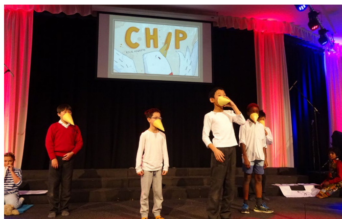
Book Week Chapel