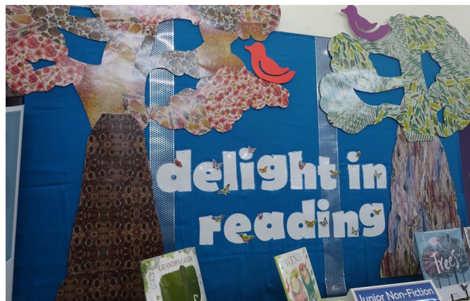
Book Week Displays