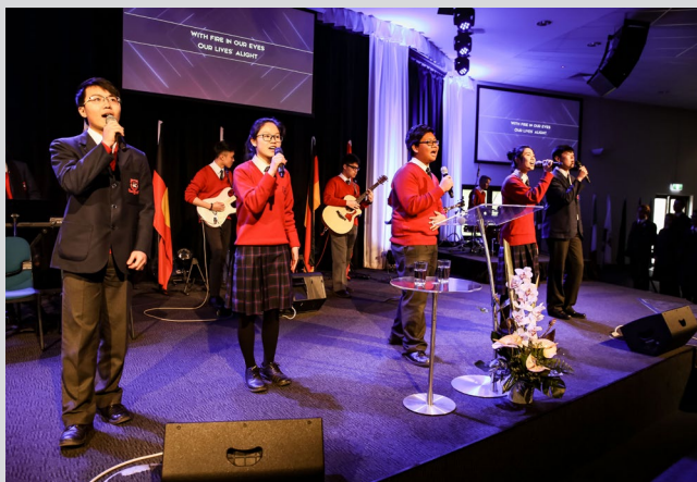
International Students leading singing at Chapel

As we celebrate International Week at Oxley, I am reminded of just how inspirational the students are. They have joined us from around the world to study in Australia. Students from China, Hong Kong, Macau, Vietnam, Burma, Malaysia, and elsewhere. Some moving to Australia with their families, many leaving their families behind, and the comforts of home, to venture to an unknown land, surrounded by strangers, unfamiliar food and culture.