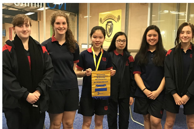
Senior EISM Table Tennis Team

Year 8/9 will have the opportunity over the next three weeks to try out for Term 4 EISM sport. The girls will have the opportunity to try out for softball, volleyball (2 teams), soccer, tennis and badminton. The boys can try out for cricket, hockey, volleyball (2 teams), tennis and badminton. The Year 7 students will finish their rounds before we start trials for Term 4.