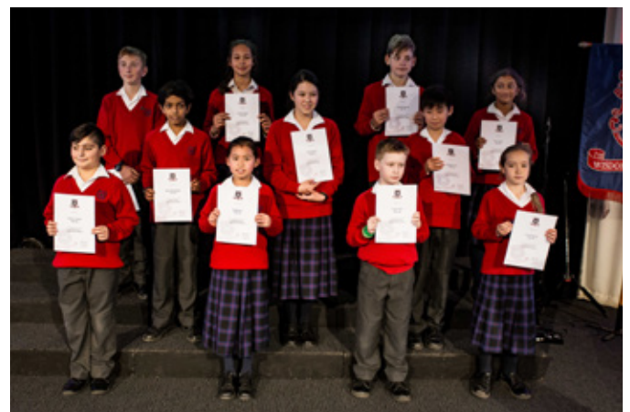
Semester 2 Home Group Captains