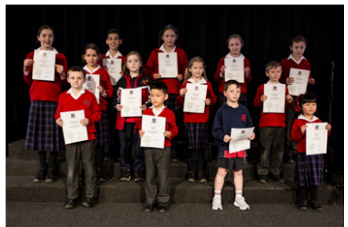
Semester 2 Enviro Captains