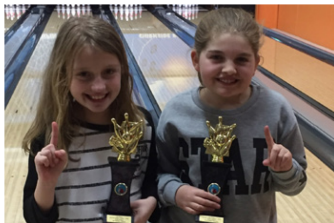
Rock N Bowl team with their first place trophies