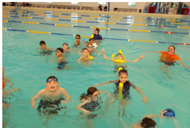
Year 3 enjoying fun water play activities

We have had an action packed start to Term 3! We loved going to the swimming program at Kilsyth Centenary Pool, where we developed our water safety skills. We improved our swimming strokes and wore our pyjamas in the water when learning survival skills. Swimming was a great experience and is such an important skill for every child to develop.