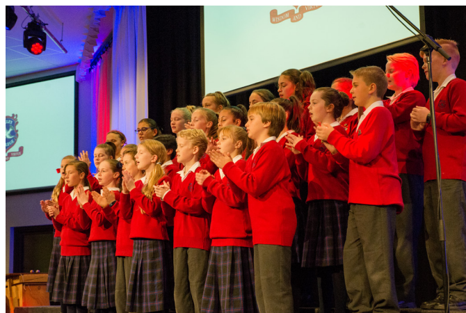
2016 Junior Ensemble Evening

On Wednesday 28 June we will hold our Junior Ensemble Evening. This concert will involve nearly 100 Junior school students in string, percussion and choir ensembles. It promises to be a great evening.