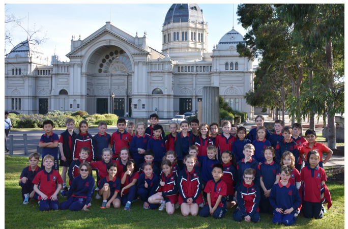
Year 3 outside the Royal Exhibition Building