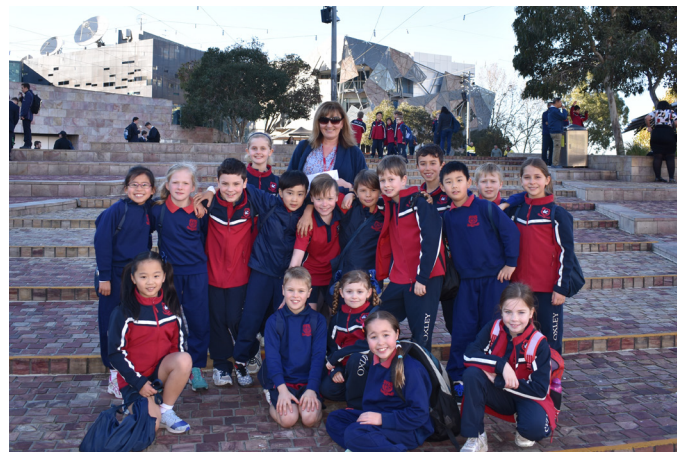
At Federation Square

We had a wonderful excursion exploring the history of Melbourne. We walked along Birrarung Marr, imagining how this area would have looked in the past. It was exciting to see the William Barak Bridge and some Aboriginal sculptures. At the Melbourne Museum, we saw artefacts depicting how Melbourne has changed over time. Did you know that Chirnside Park became an official suburb in 1969? Walking into an old wooden house that didn't have an inside toilet or running water really made us think about how fortunate we are to live in 2017.