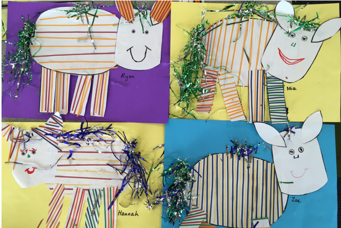
Prep patterned zebras

Recognising and creating patterns is an important part of a child's mathematical development, which we revisit regularly across the year. Through a range of activities, we copy, continue and create patterns, using a variety of materials. This week, we explored patterns in the world around us. We identified patterns that are on animals and buildings and in nature. We then made our own patterned zebras.