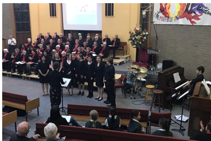
The Vocal Ensemble performing at the Jubilate Choir Concert

On Saturday 24 June our Vocal Ensemble performed at the Jubilate Choir Concert at Dandenong Reform Church. Our Vocal Ensemble was one of a number of ensembles performing at this event which also included a community choir and ensembles from Donvale Christian College. Well done to our Vocal Ensemble for their willingness to bless the community around us with their beautiful voices.