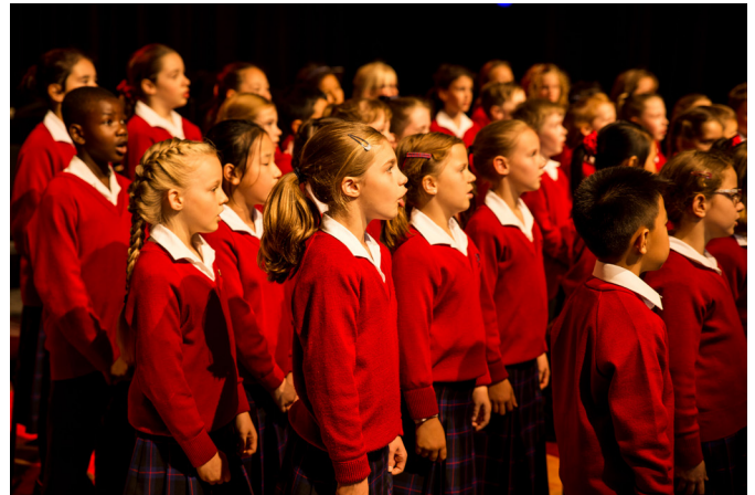
Junior School Choir performing at Open Day

Students will be issued with their end-of-semester reports on Friday 30 June. Celebrating achievement is a positive action, leading to opportunities to set realistic goals for future learning. Staff, including our Specialist teachers, look forward to meeting with parents early in Term 3 to discuss Semester 1 reports and ways to collaboratively support student learning both at school and at home. Parent Teacher Interviews will be held on Tuesday 1 August (4.00 – 8:30pm) and Thursday 3 August (4.00 – 6.00pm). Please see the letter accompanying your child's report for details on how to book interviews via the Oxley Christian College website - Parent Portal.