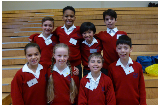
Year 5 students at Maths Games Day

The students formed two teams of four, and competed against 120 other students, making up 30 teams, from schools across Melbourne. The day was broken into three sessions which included problem solving, automatic response and probability.