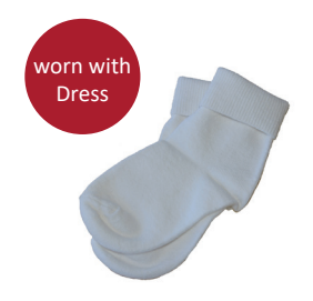
Sock White Turnover