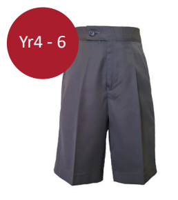
Shorts Elastic Back