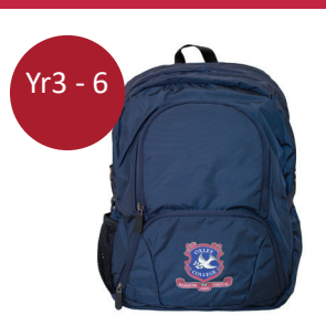
Airopak Schoolbag MED