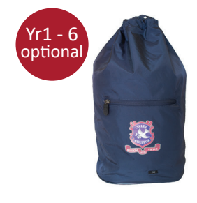
Havasak Sports Bag