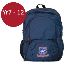
Airopak Schoolbag LRG