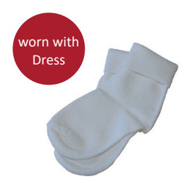
Sock White Turnover